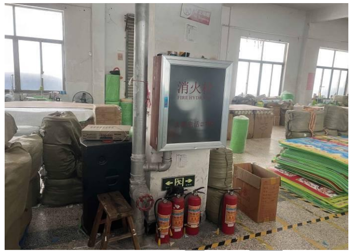
Fire fighting equipment