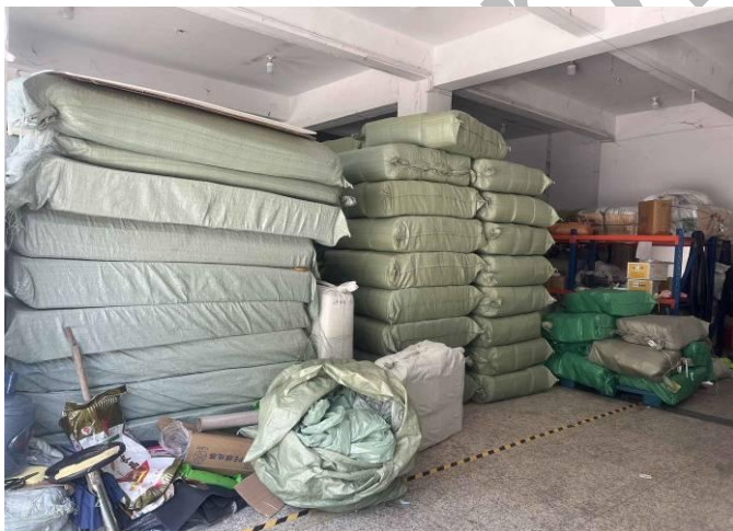
Workshop and warehouse