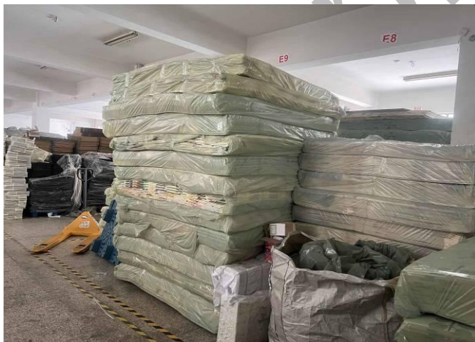
Workshop and warehouse