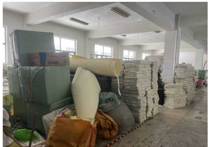
Workshop and warehouse