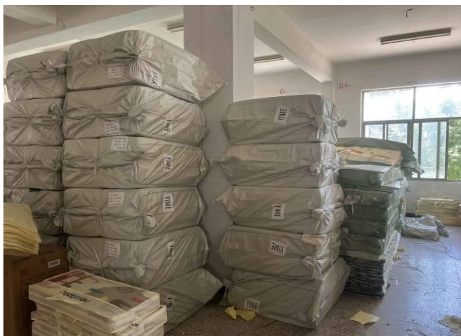
Workshop and warehouse