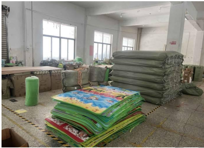
Workshop and warehouse