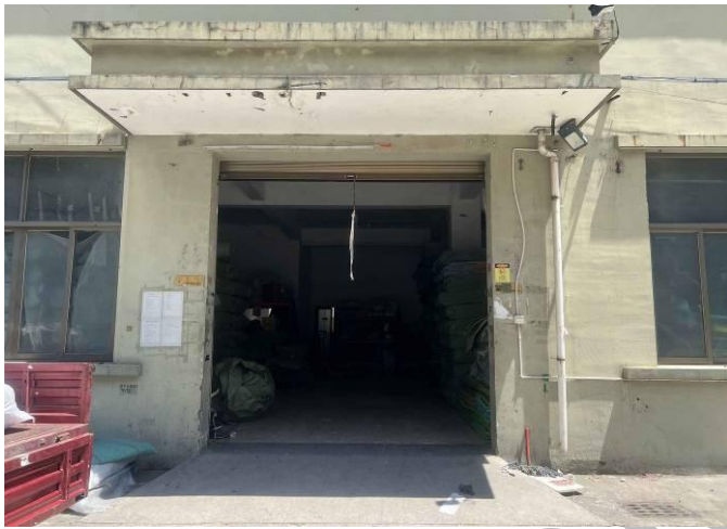
Workshop and warehouse