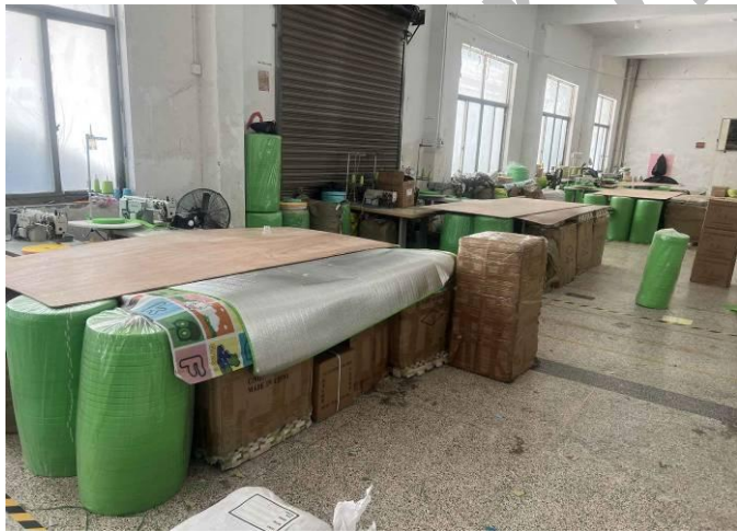
Workshop and warehouse