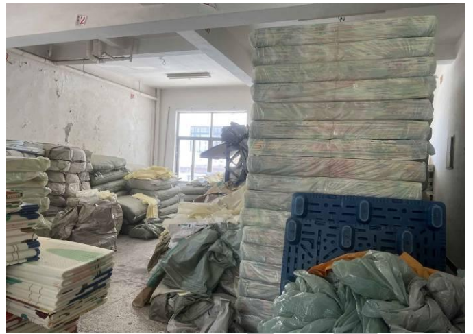
Workshop and warehouse