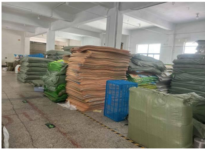
Workshop and warehouse