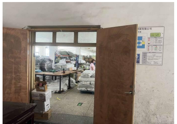
Workshop and warehouse