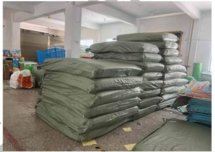
Workshop and warehouse