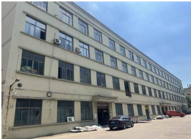
Main building-workshop and office building