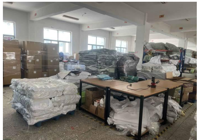
Workshop and warehouse