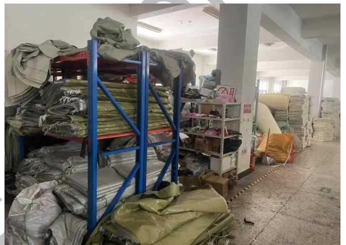
Workshop and warehouse