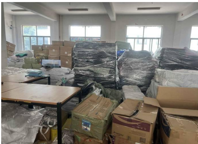
Workshop and warehouse