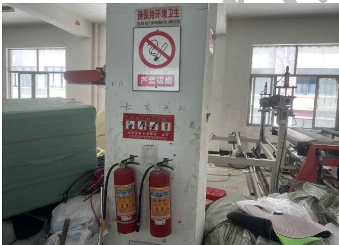
Fire fighting equipment