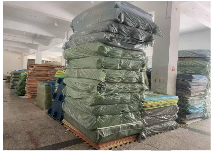
Workshop and warehouse