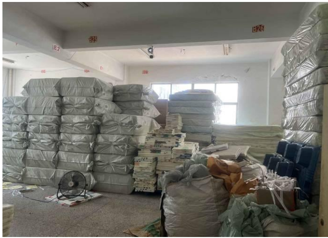
Workshop and warehouse