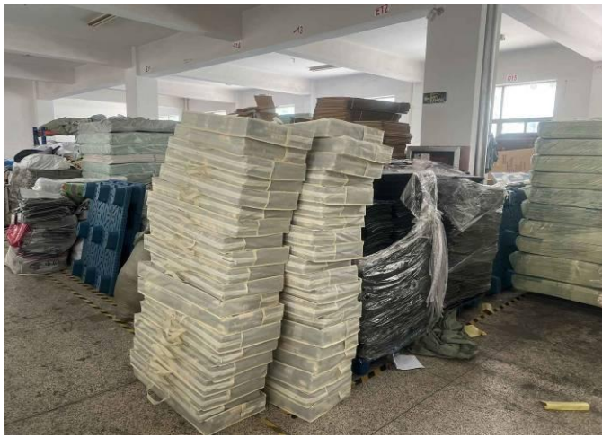
Workshop and warehouse