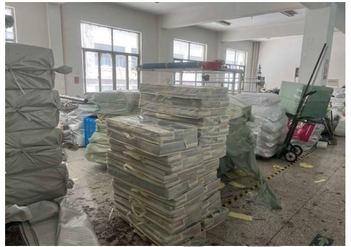
Workshop and warehouse