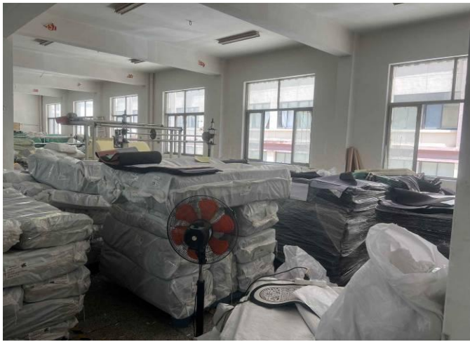
Workshop and warehouse