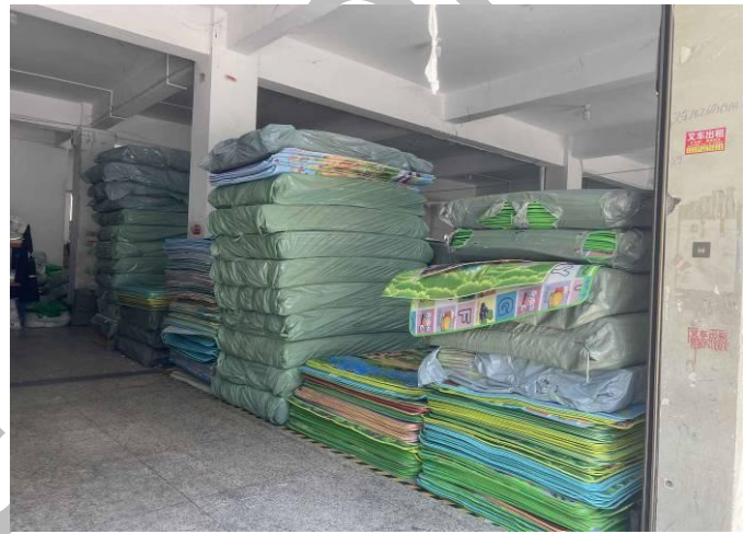
Workshop and warehouse